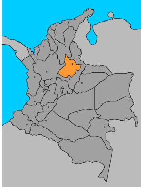
Santander Region, Colombia

: a strong durable fiber obtained from the leaves of a succulent tropical American plant of the genus : CABUYA; also : any of several plants that yield fique (such as Furcraea macrophylla , F. andina , F. foetida synonym F. gigantea ) : SISAL