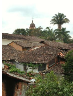
“Curiti” - knitting village