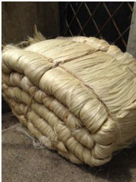
Fique fiber pack