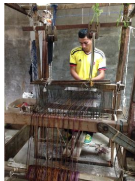
Hand weaving loom