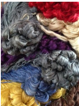
modified fiber pack